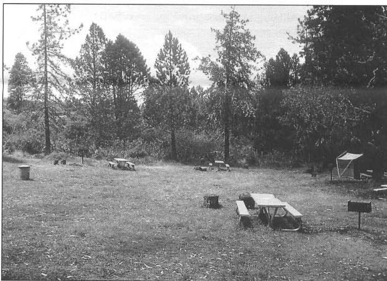
Figure 1. Picnic and camping area at Hosmer Grove, Haleakala National Park,

nated by Mamane ( Sophora chrysophylla ), Pukiawe ( Syphelia tameiameae ), Pilo ( Coprosma montana ), 'Ohelo 'ai ( Vaccinium reticulatum ), and other shrubs (Pratt 1999). Four species of Hawaiian honeycreeper are common in the area: 'Apapane ( Himatione sanguinea ), 'I'iwi ( estiaria coccinea ), Maui 'Alauahio ( Paroreomyza montana ), and the Maui Nui subspecies of Common 'Amakihi ( Hemignathus virens wilsoni ).