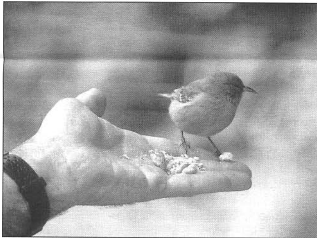
Figure 3. Common 'Amakihi accepting handout of bread crumbs. Same locality as Figure 1, October 1994.