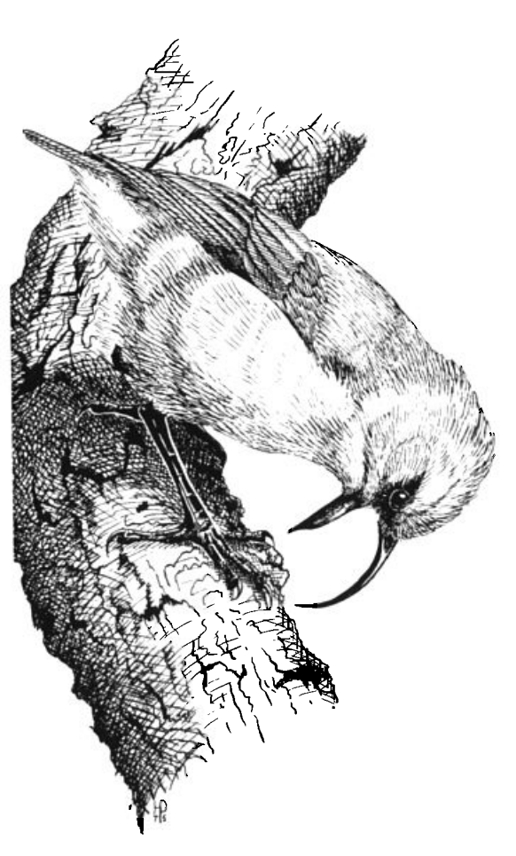
Akiapolaau, Hemignathus wilsoni.

become thoroughly familiar with both the vocalizations and visual identifying marks of all species concerned. With but one exception (see below), he at no time during his earlier studies saw anything comparable to the activity and numbers of birds witnessed on August 19.